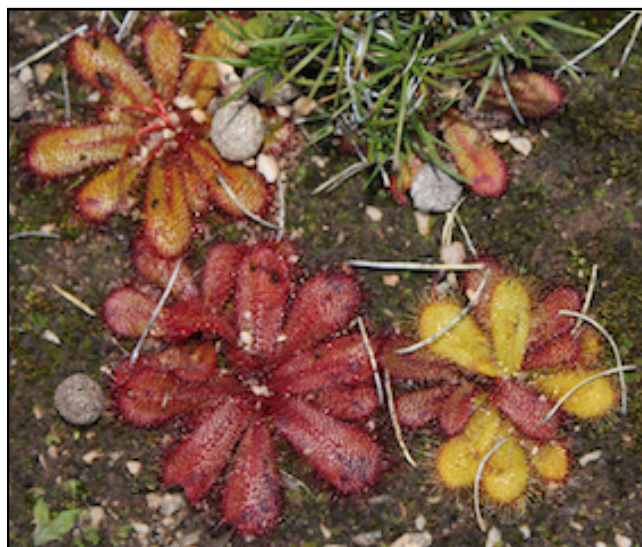
Below - Drosera bulbosa, Merredin, W.A.