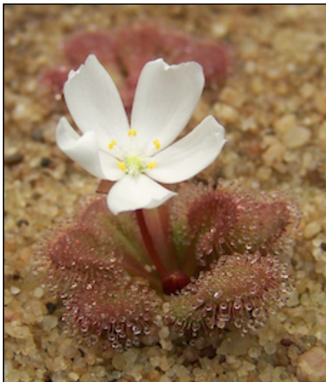
Above - Drosera aberrans