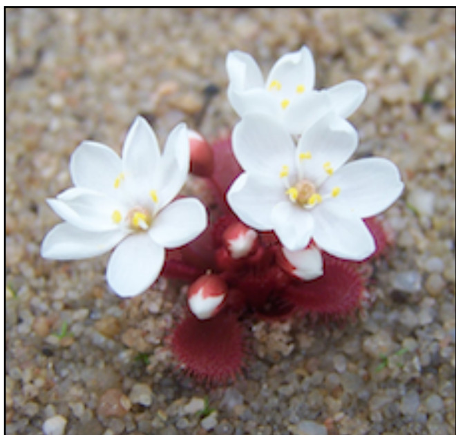
Below Right - Flower of Drosera tubaestylis