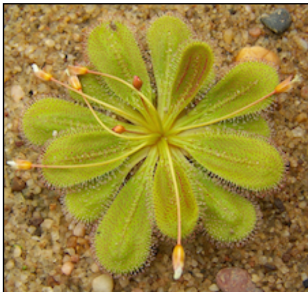
Above Right - Drosera aff. bulbosa "El Caballo Blanco Form"