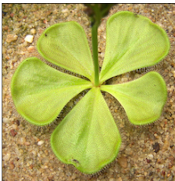
Below - Drosera aff. tubaestylis "Brookton Large Form"