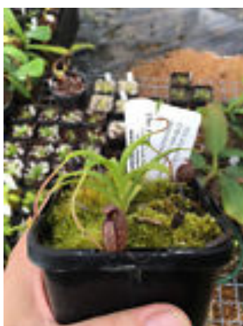
Nepenthes aristolochioides $112.50