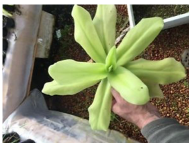
Pinguicula gigantea $50