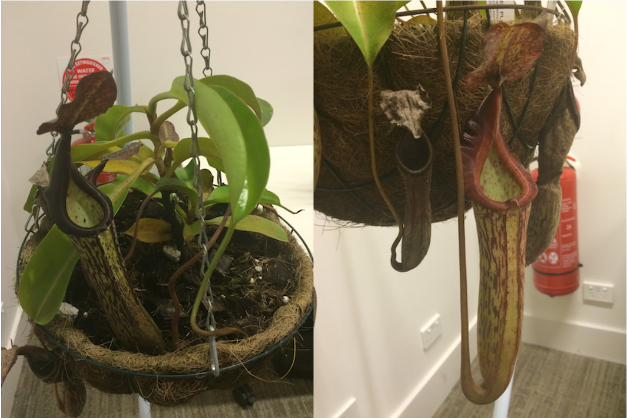
Nepenthes boschiana x fusca

The society's webpage is back on-line in a temporary capacity. The society's executive is looking at re-constructing the site. Any feedback into its new look would be appreciated. Any members with web-page expertise are requested to assist with this process.