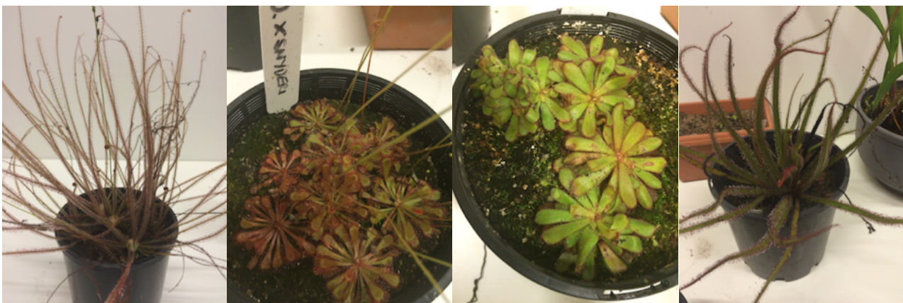
D. filiformis "Florida all red"