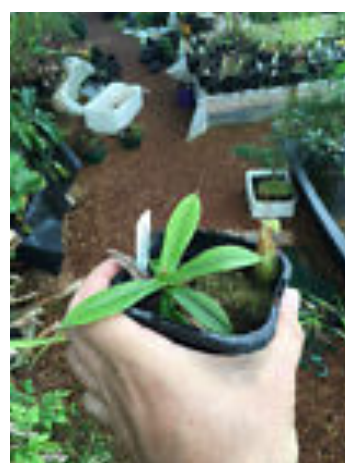
Nepenthes hamata $284.90