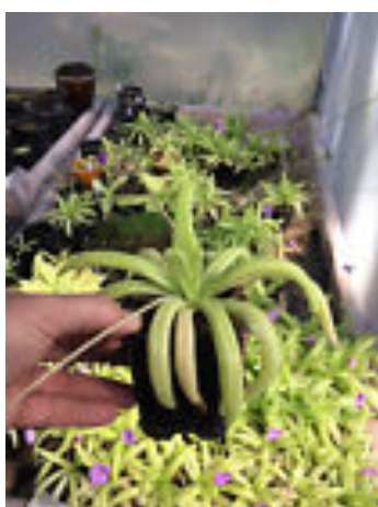
Pinguicula moctezumae x gigantea $19