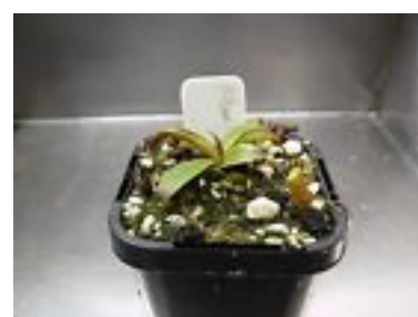
Nepenthes attenboroughii $255