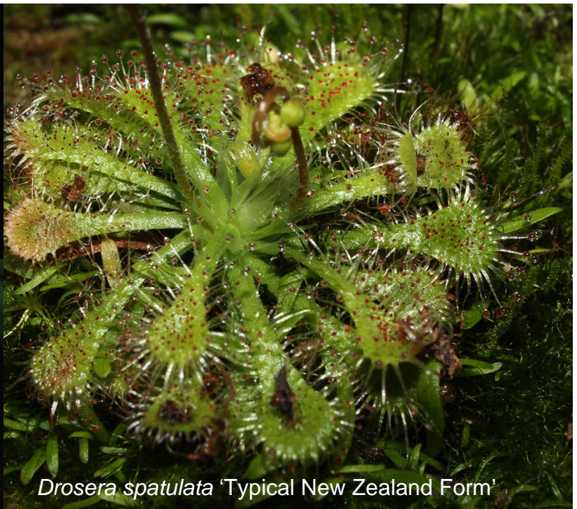
Drosera spatulata 'Typical New Zealand Form'