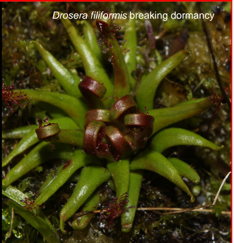
Drosera filiformis breaking dormancy