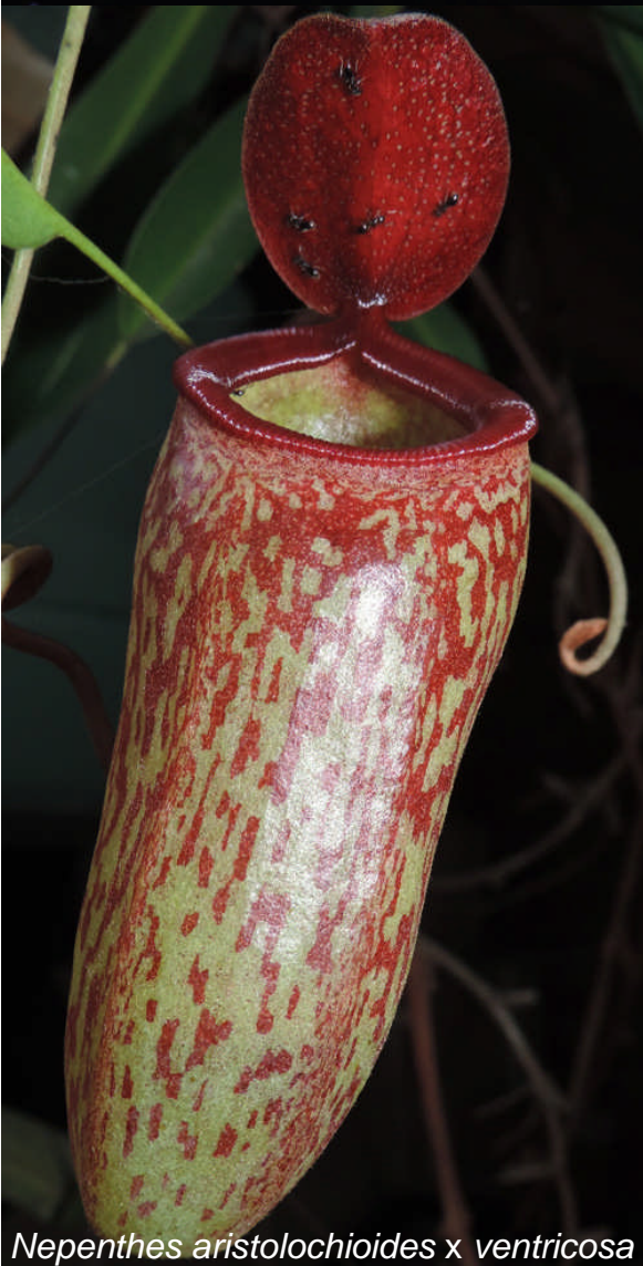
Nepenthes aristolochioides x ventricosa