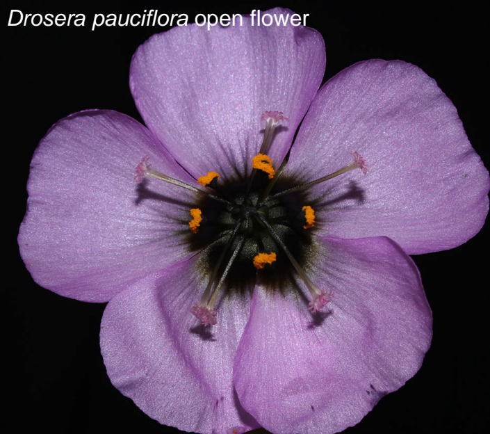
Drosera pauciflora open flower