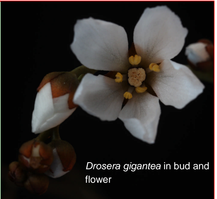
Drosera gigantea in bud and flower