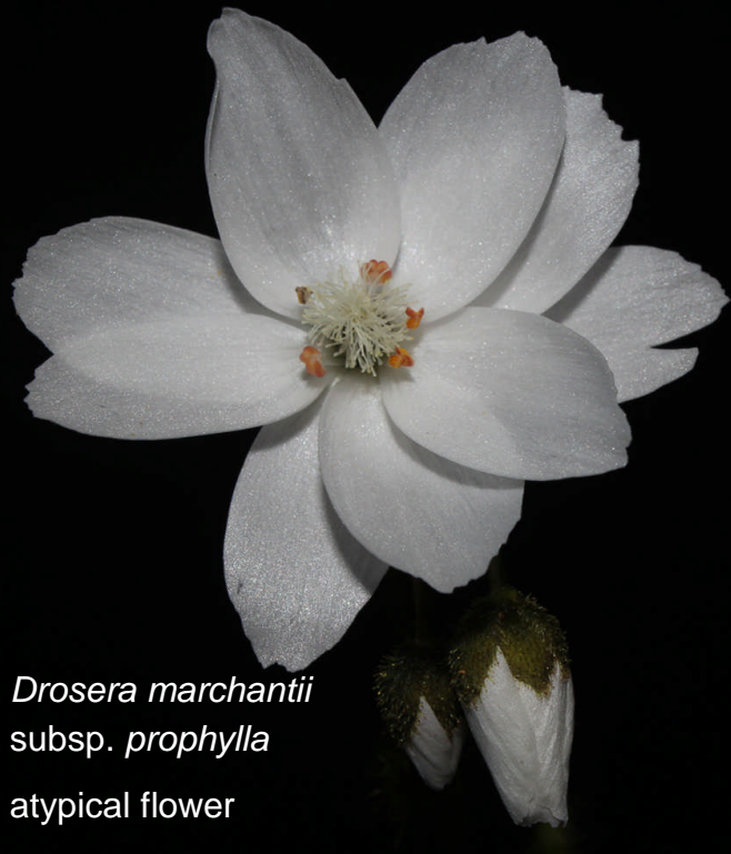
Drosera marchantii subsp. prophylla atypical flower