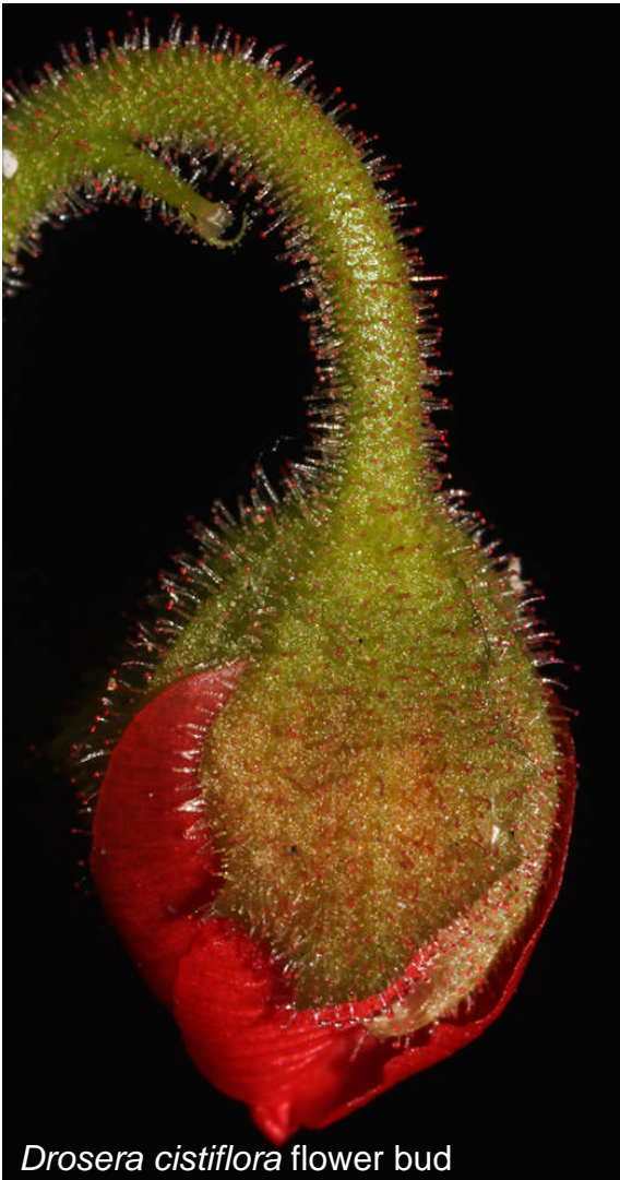
Drosera cistiflora flower bud

It will be great to see the range of photos submitted for this event.