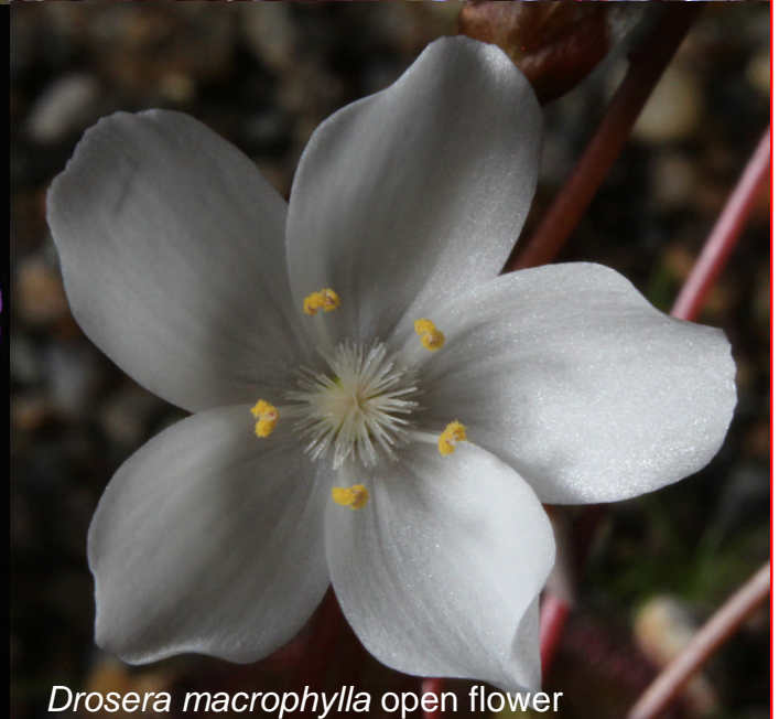
Drosera macrophylla open flower