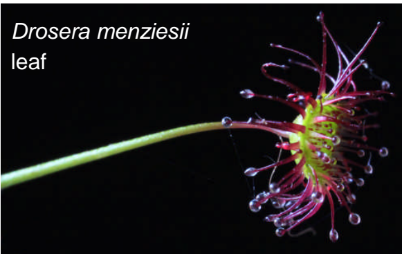
Drosera menziesii leaf

It has been suggested that the Society has a presence at Dam Fest Warragamba, in South Western Sydney, which is an annual event held on the third Sunday of October: http://www.sydney.com/events/dam-fest-warragamba More details to come.