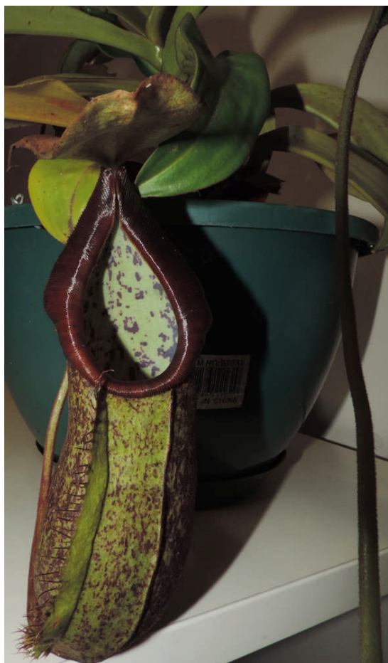
Nepenthes hirsuta x spathulata

Renovations for Woodstock have been delayed again and are now scheduled to start in SEPTEMBER. Thus the August meeting will be at Woodstock Community Centre in the Group Room 1 as usual.