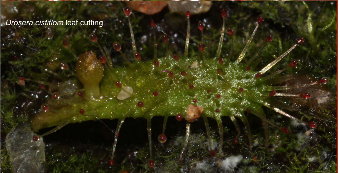
Drosera cistiflora leaf cutting