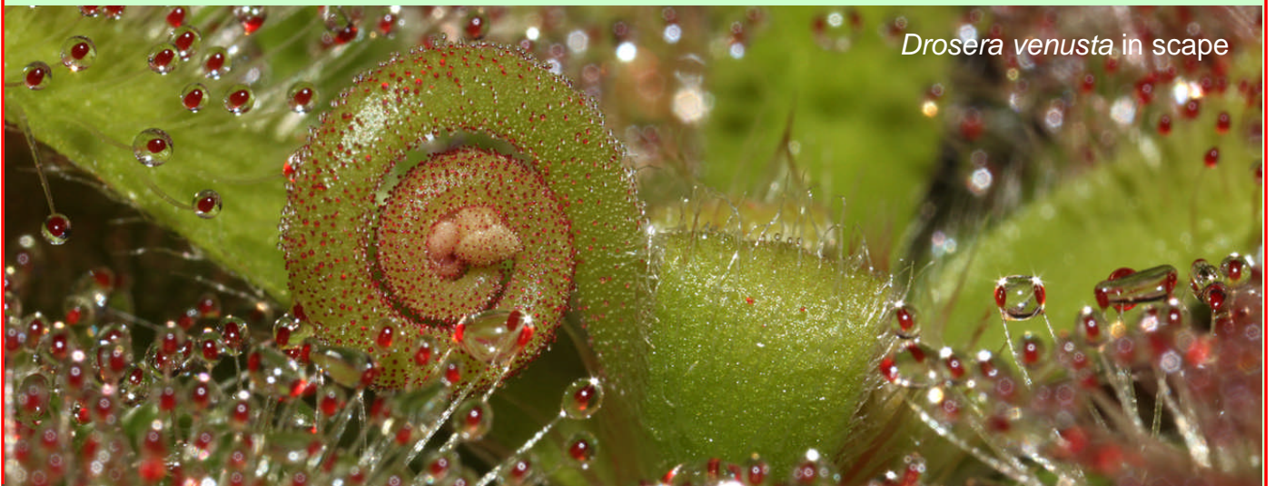
Drosera venusta in scape