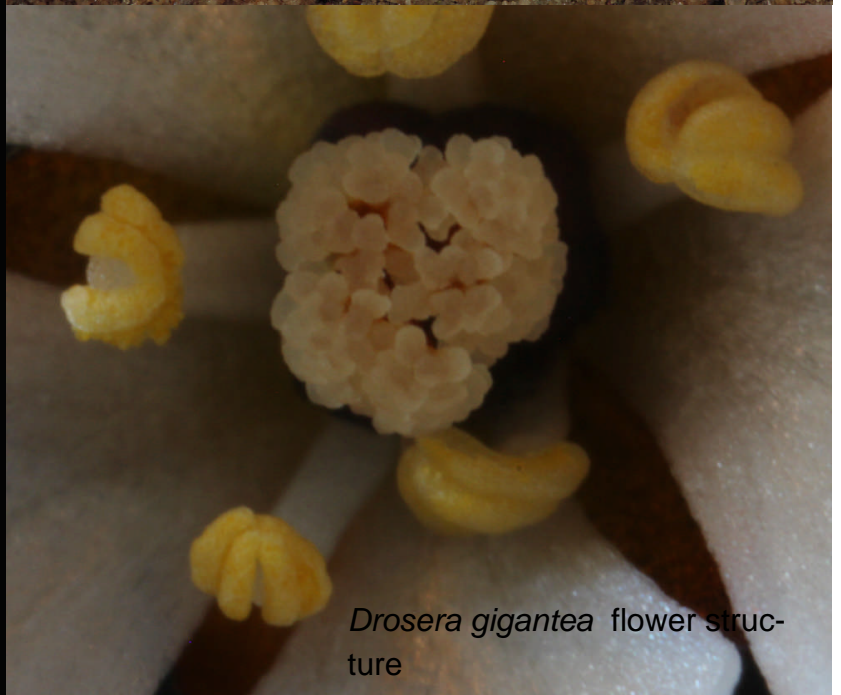
Drosera gigantea flower structure