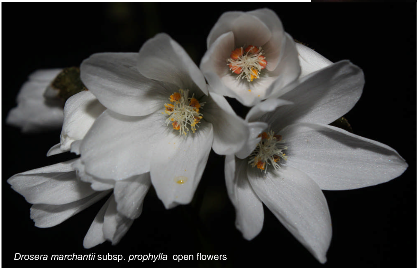
Drosera marchantii subsp. prophylla open flowers