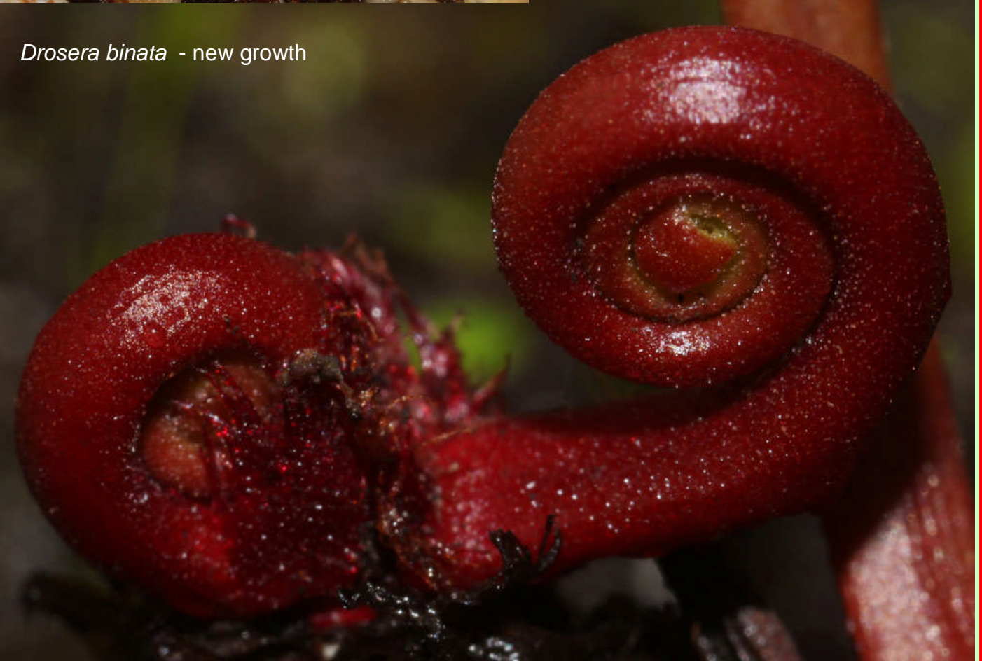
Drosera binata - new growth