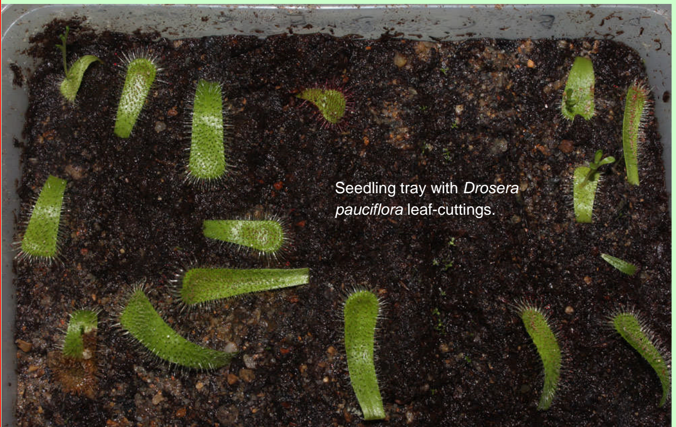
Seedling tray with Drosera pauciflora leaf-cuttings.

I frequently use a clean rectangular fast food container half-filled with a mix of about half:half peat moss and quartz sand. The mix is best kept moist rather than sodden. For plant management I make rows across the long axis and label each furrow on the outside of the container with 'A', 'B', 'C' etc. Seed is sown in each furrow or intervening mound (depending on how wet the plant prefers to grow) and the code of what is sown per row is added to a white plastic plant label that is placed inside the container. Leaf cuttings are placed on the surface of the mix, often with the base of the leaf shallowly buried in the moist mix. The lid is placed back on the container which is placed at the base of an east-facing window and receives about an hour of direct sun light at this time of year.