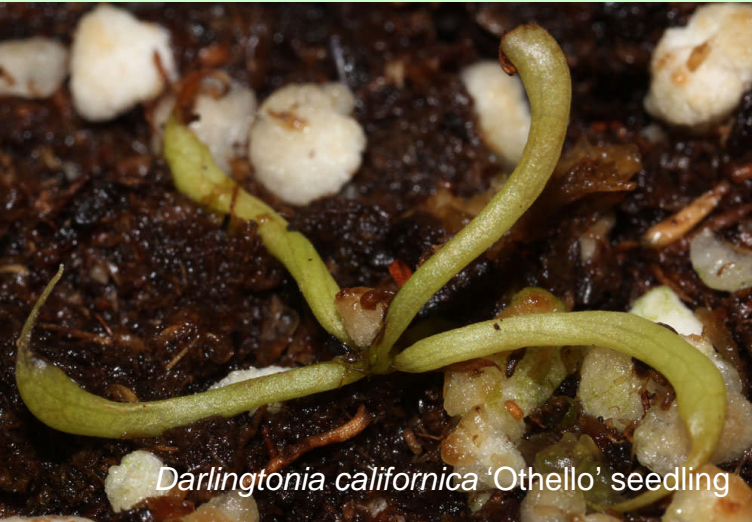
Darlingtonia californica 'Othello' seedling