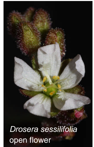
Drosera sessilifolia open flower

It will be great to see the range of photos submitted for this event.