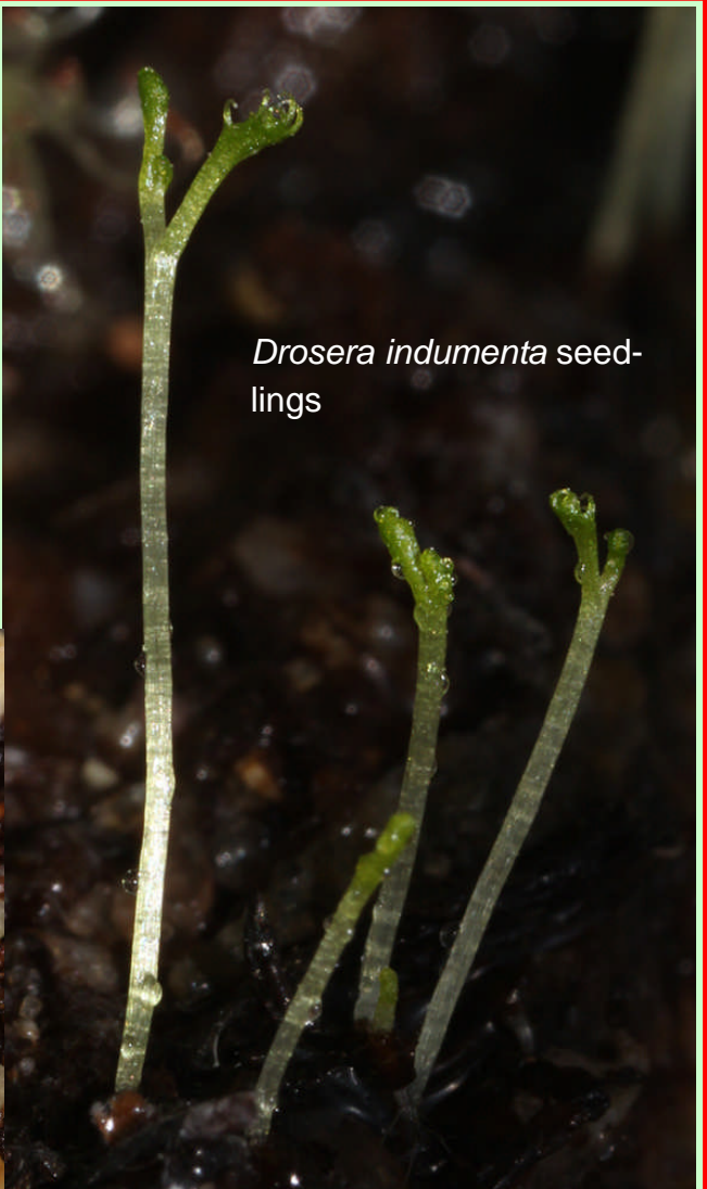
Drosera indumenta seedlings

Fungus in such a seed terrarium can be a problem and its risk of occurrence is reduced by using a clean and sterile container and applying good hygiene practice to all items placed inside it, such as clean seeds which lack chaff or other impurities. A general fungicide may be applied at the dosage recommended on the label. Even after fungal attack some seeds may still survive, so it is often worthwhile to keep hold of those growing chambers for a