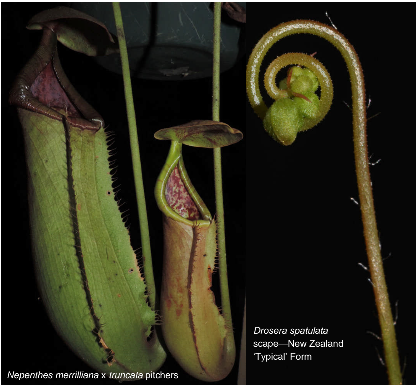
Nepenthes merrilliana x truncata pitchers

It has been suggested that the Society has a presence at Dam Fest Warragamba, in South Western Sydney, which is an annual event held on the third Sunday of October: http://www.sydney.com/events/dam-fest-warragamba Further details are being sourced, but it may be a great venue to both raise the general public's awareness of the Society and also for members to sell plants. More details to come.