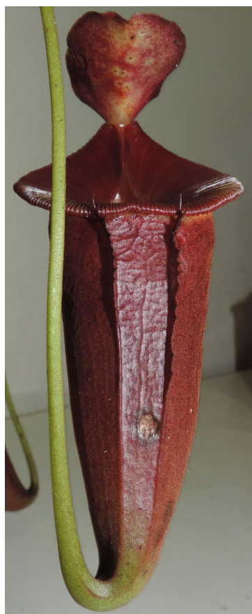
Nepenthes lowii x jacquelineae

https://www.facebook.com/#!/pages/Australasian-Carnivorous-Plant-Society/194049760656595?ref_type=bookmark