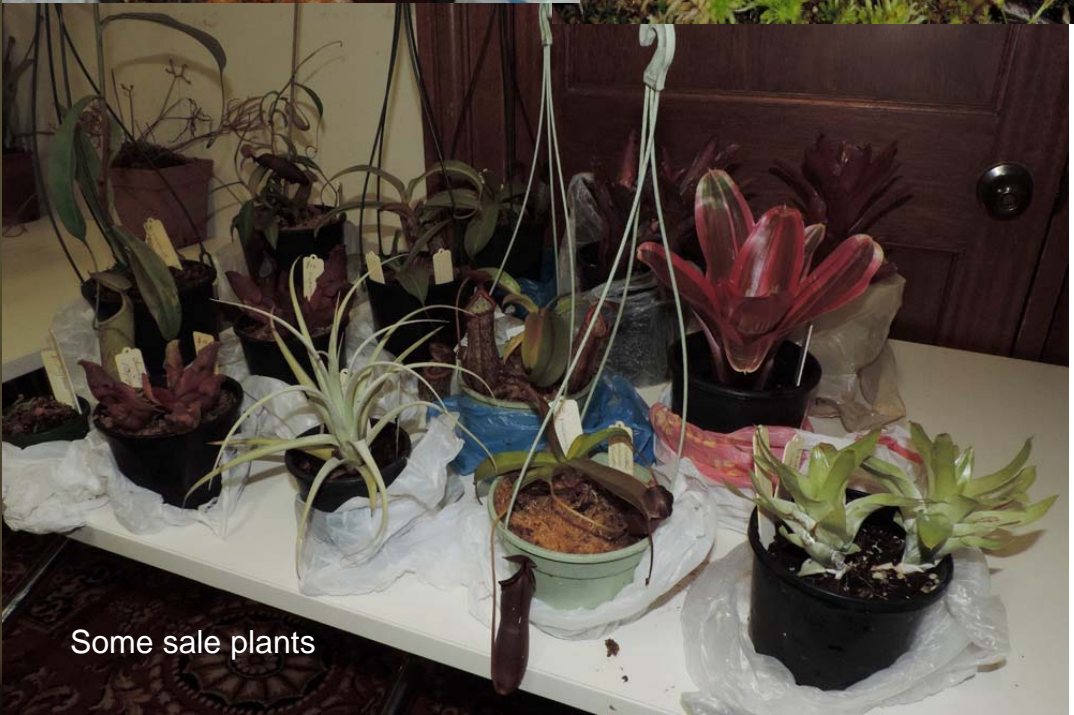
Some sale plants