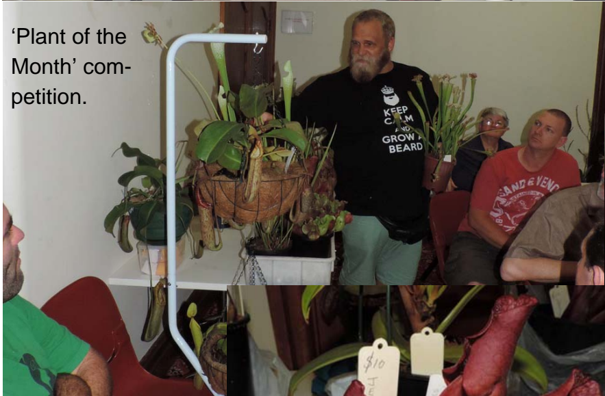
'Plant of the Month' competition.