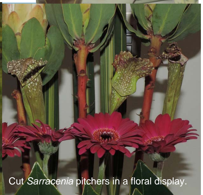
Cut Sarracenia pitchers in a floral display.