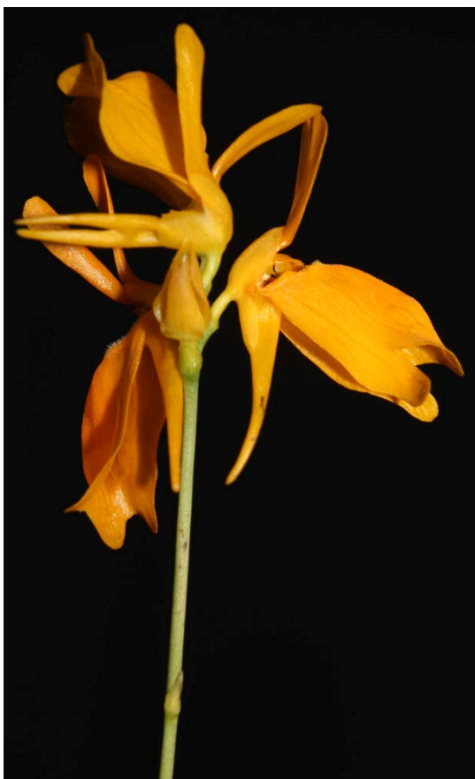
Utricularia juncea .

https://www.facebook.com/#!/pages/Australasian-Carnivorous-Plant-Society/194049760656595?ref_type=bookmark