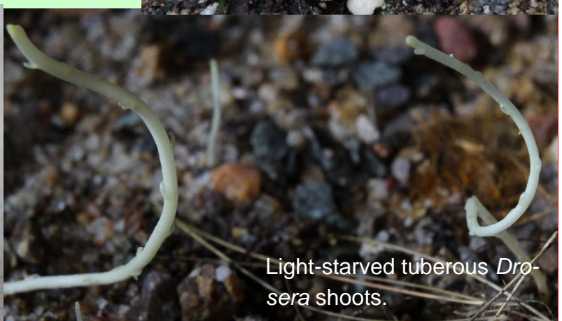
Light-starved tuberous Drosera shoots.