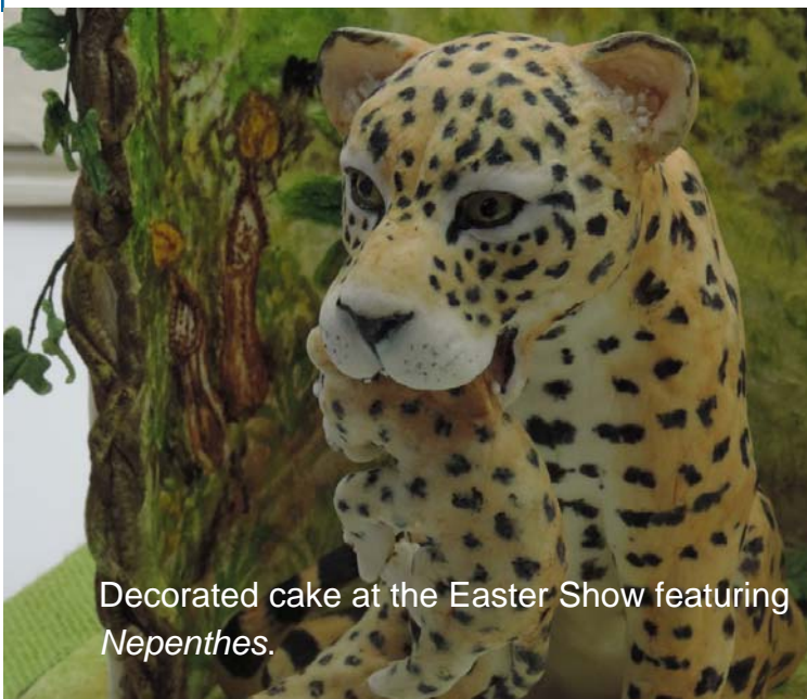
Decorated cake at the Easter Show featuring Nepenthes .