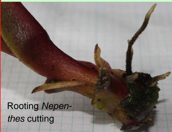
Rooting Nepenthes cutting