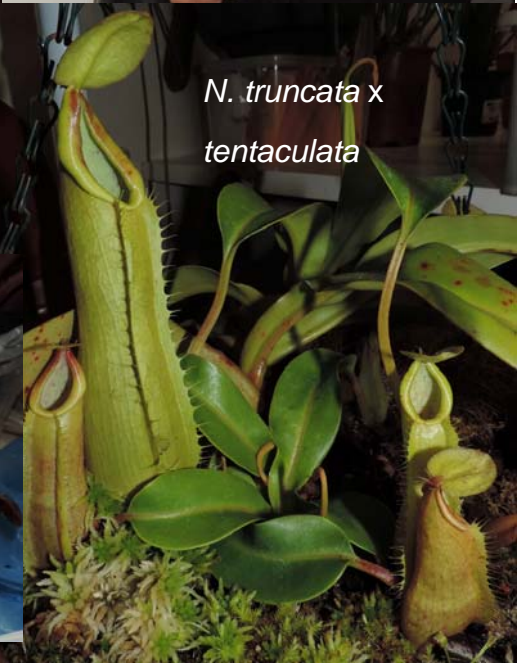
N. truncata x tentaculata