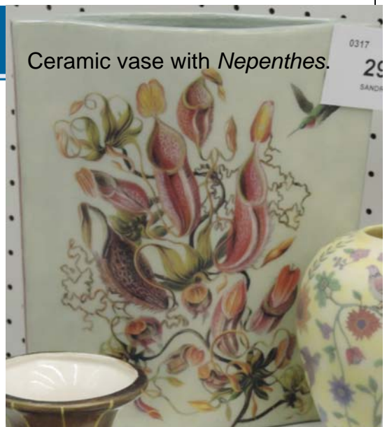
Ceramic vase with Nepenthes .

TECH 2U Pty Limited is based in Gordon, Sydney, Australia.