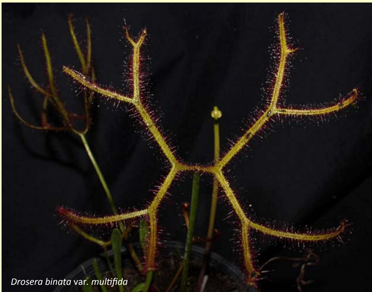
Drosera binata var. multifida