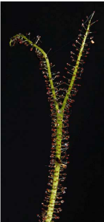
Drosera filiformis —mutant leaf with a bifurcated apex.

https://www.facebook.com/#!/pages/Australasian-Carnivorous-Plant-Society/194049760656595?ref_type=bookmark