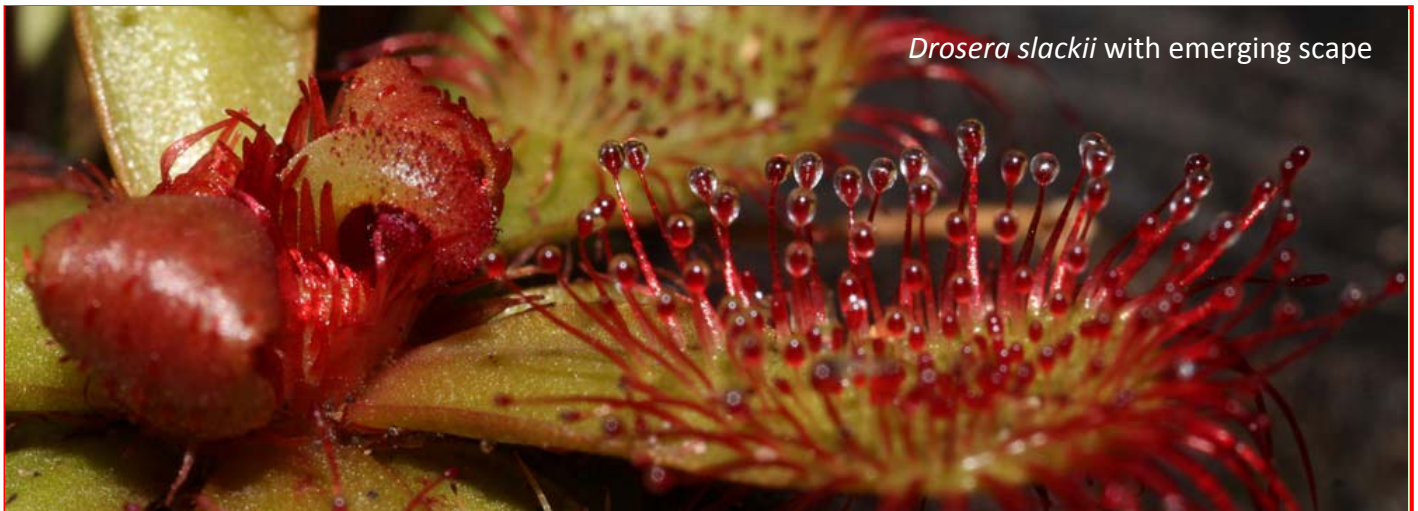
Drosera slackii with emerging scape