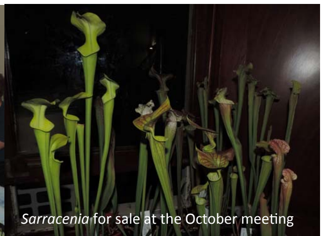
Sarracenia for sale at the October meeting