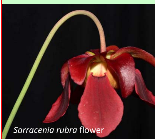
Sarracenia rubra flower