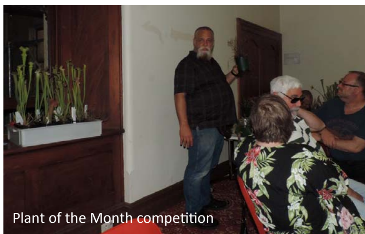
Plant of the Month competition

Donations of seed are welcome. This is a service for all members of the society so please help keep it going.